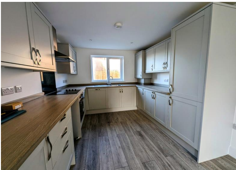
Address: 8, Kingston Farm Lane, East Cowes, PO32 6LL RRN: 9350-2858-2020-2007-1705